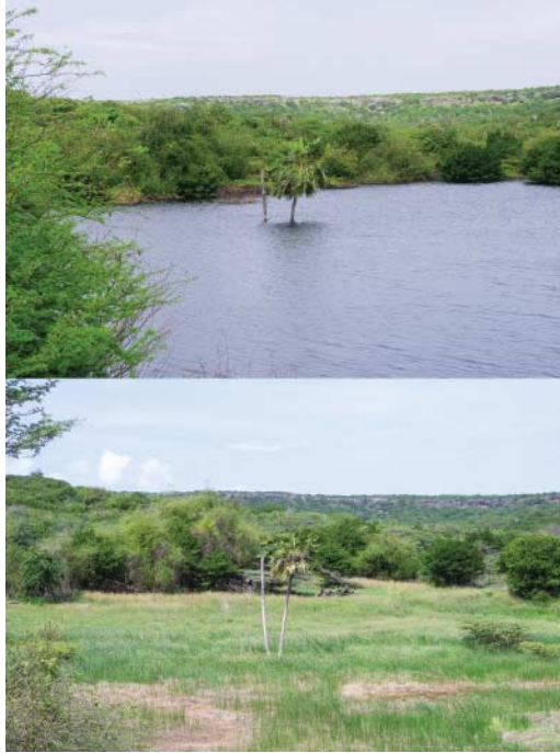
Figure 1. Dam at Malpais, Curaçao, in wet (16 January 2011) and dry (18 December 2013) periods.

The hilly western half of the island has slightly higher rainfall than the flatter eastern side. Average annual rainfall shows a roughly 6–7-year cycle (Henriquez, 1962; Debrot, Miller, Miller, & Leysner, 1999) as linked to the El Niño-La Niña oscillation (Martis, van Oldenborgh & Burgers, 2002). Average wind direction and speed is NE at 6.9 \text{ m s}^{-1} (10 m height).