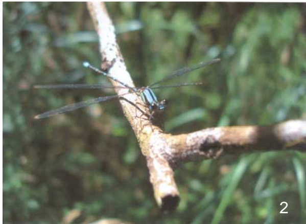
Figure 2. Heteragrion cyane ♂, Mata do Baú Barroso, MG, 27 March, 2010.

whitish blue and a black distal ring preceded by a lateral pale area. (Figure 2) S3–S8 with a mid-dorsal whitish blue line. S8 black with a whitish blue lateral mark situated distally. S9 whitish blue, ventrally black. S10 black with a lateral bluish white area (Figures 3–5). Cercus black.