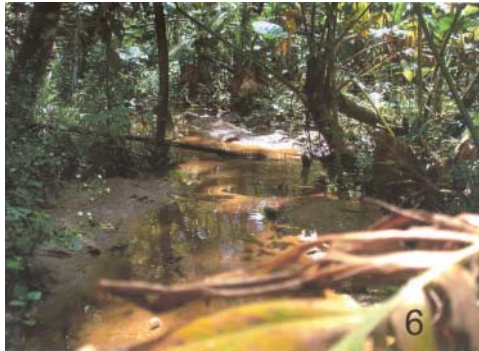
Figure 6. Habitat of Heteragrion cyane in Mata do Baú, Barroso, MG.

revealed a rich fauna, with 57 species, five in the genus Heteragrion . The rich odonate fauna and the good preservation of this remnant of Brazil's Atlantic Forest are being regarded as arguments for the creation of a nature reserve in the area.