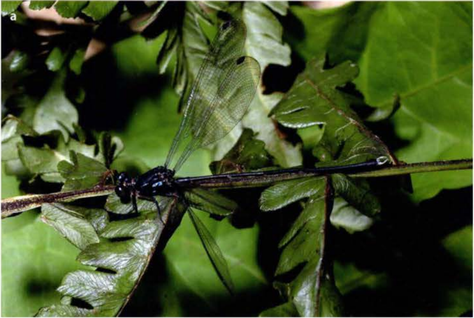
Colour plate IIIa: Argiolestes roon sp. nov. — male, Indonesia, West Papua Province, Roon Island, 12 xi 2008.