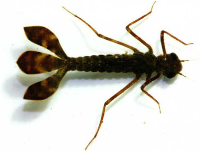
Colour plate IV: Podolestes orientalis from West Malaysia — (a) mature male at a shady pool at Bangi Forest Reserve, 28 February 2009; (b) final stadium larva, 21 February 2009 collected from the same pool. Note the broad and flattened caudal lamellae of the larva that are horizontally inserted and oriented.