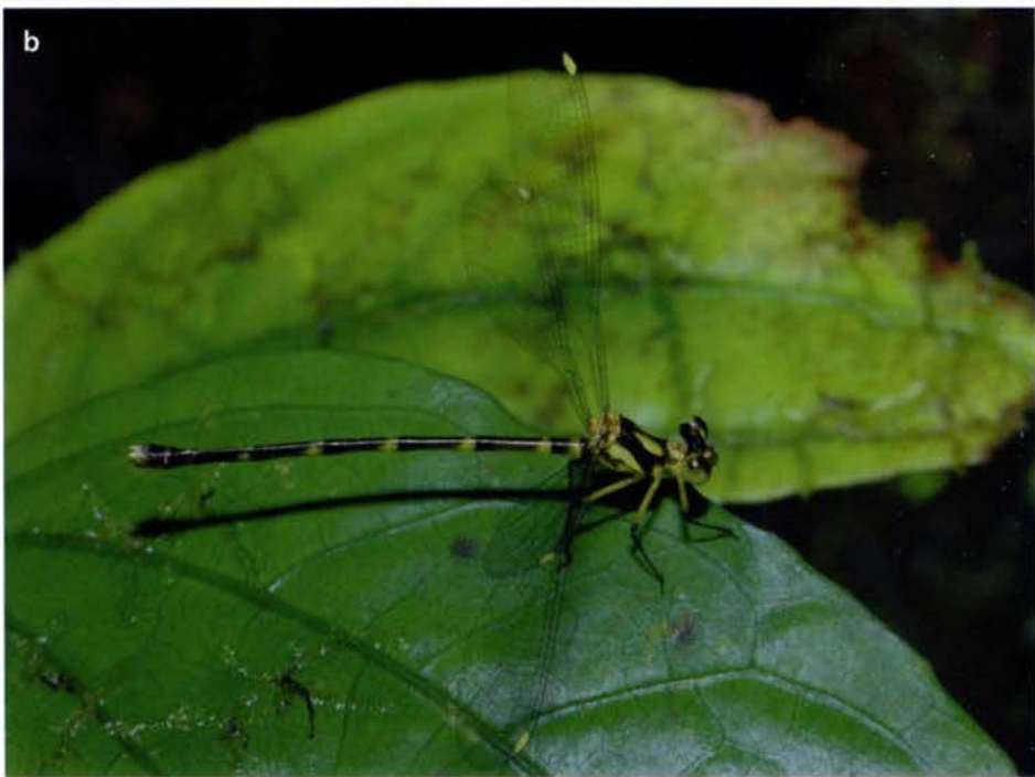
Colour plate II: Argiolestes muller sp. nov. — (a) male, Western Province, Papua New Guinea, 16 ii 2008; (b) female, same data.