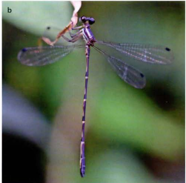
Colour plate IIIb: Archaeopodagrion armatum sp. nov., male — small forested stream south of Zamora, Zamora-Chinchipe Province, Ecuador, 2 April 2008.