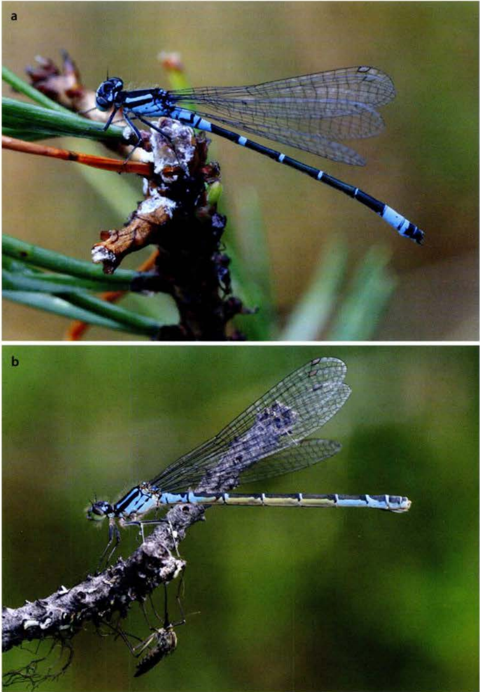
Colour plate I: Coenagrion glaciale in Europe — (a) male, near Khaimusovo (loc. 3); (b) female, near Maletino (loc. 2). Arkhangelsk oblast, European Russia, 7 July 2009.