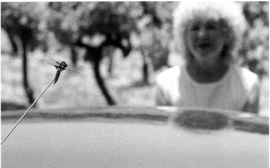
Figure 1: Territorial male of Libellula depressa perched on the tip of the radio antenna of a dark-green car parked by a vineyard. The body axis is held parallel to the steeply incident sun rays, thus minimising heating of the body. The real colour of the car roof is not visible because the sky and the nearby surroundings are mirrored at the shiny surface.

The reflection-polarization patterns of the car (Figs 2-4) were measured on 25 June 1999 in Rüti, Switzerland (47°16'N, 08°52'E) at 09:30 h solar time on a sunny day, under a clear sky, by videopolarimetry in the red (R), green (G) and blue (B) part of the spectrum at \lambda_B = 450 \pm 40 nm (wavelength of maximal sensitivity \pm half bandwidth of the camera's CCD sensors), \lambda_G = 550 \pm 40 nm and \lambda_R = 650 \pm 40 nm. The viewing angle of the videopolarimeter was horizontal. The method of videopolarimetry is described in detail by Horváth & Varjú (1997).