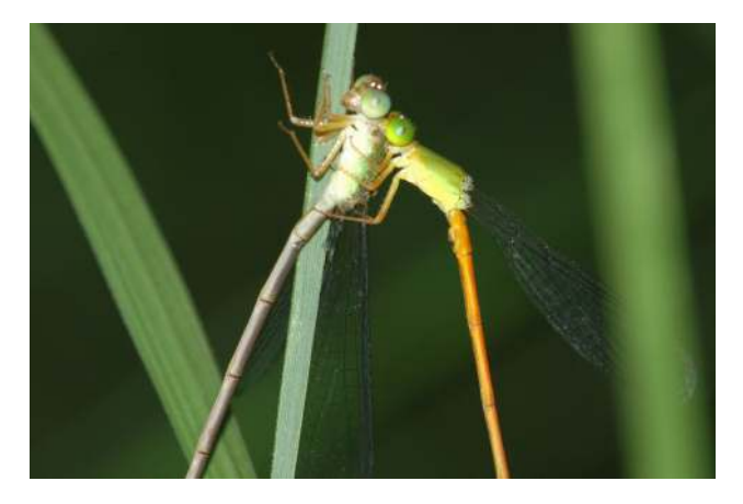
Figure 2. Male Ceriagrion auranticum attacks female.