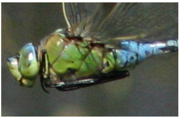
clearly not touching the head.