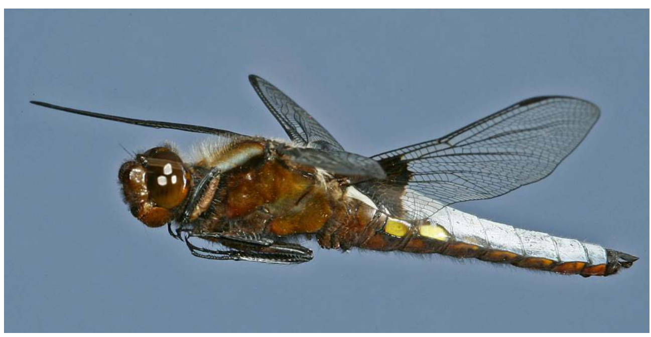
Photo 2: Libellula depressa showing how the legs are placed in flight.