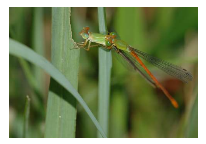
Figure 1. Male Ceriagrion auranticum seizes female.

Corbet, P.S. 1999. Dragonflies – Behaviour and Ecology of Odonata. Cornell University Press, Ithaca, New York.