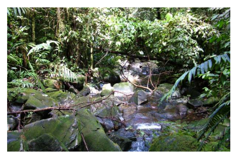
Figure 3. R. caerulea habitat, ca 1,350m, Hose Mountains.

The plan for the following day was for us to sample a slightly lower stream whilst Luke and Manau scouted