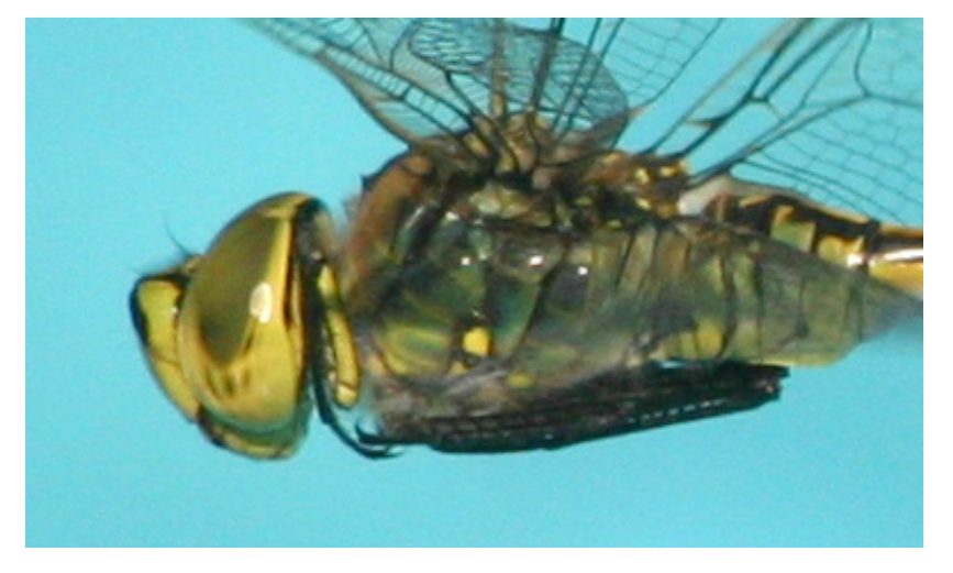
Photo 6: Hemianax papuensis with front legs firmly behind the eyes.

I still wonder about the emperors: with the legs apparently so firmly behind the eyes, they could be used for some other purpose - having so many tactile setae, they may aid in assessing body orientation, for instance.