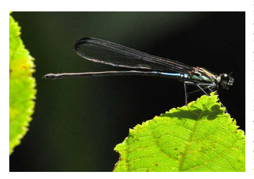
Figure 2. R. caerulea male, Hose Mts, Sarawak.

we would not get into any good habitat. The first problem was encountered the day after we arrived at the foot of the mountains. There is a logging road (no longer in use) at the northern end of the mountains, which was supposed to cross the range, reaching at least 1,300m in the process. To reach this road took about one and a half hours along an awful dirt track, but almost immediately after we got onto the logging road we were stopped in our tracks by a broken bridge. After much debate, arrangements were made to find someone from Kampung Tunoh, the