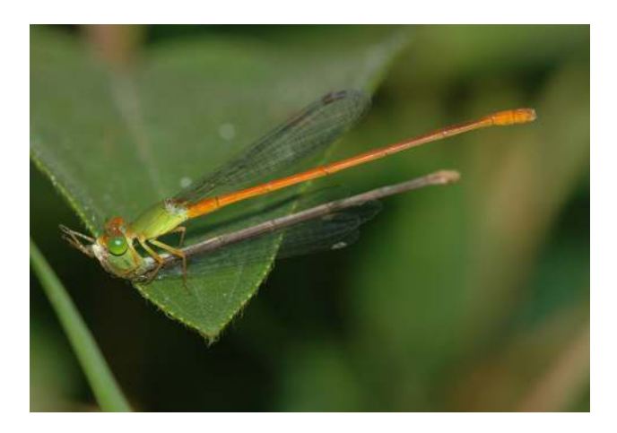
Figure 3. Male Ceriagrion auranticum consuming female.