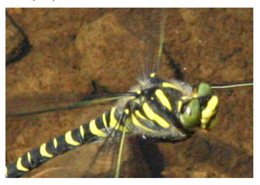
Photo 7: Cordulegaster boltonii laying eggs showing legs against thorax.