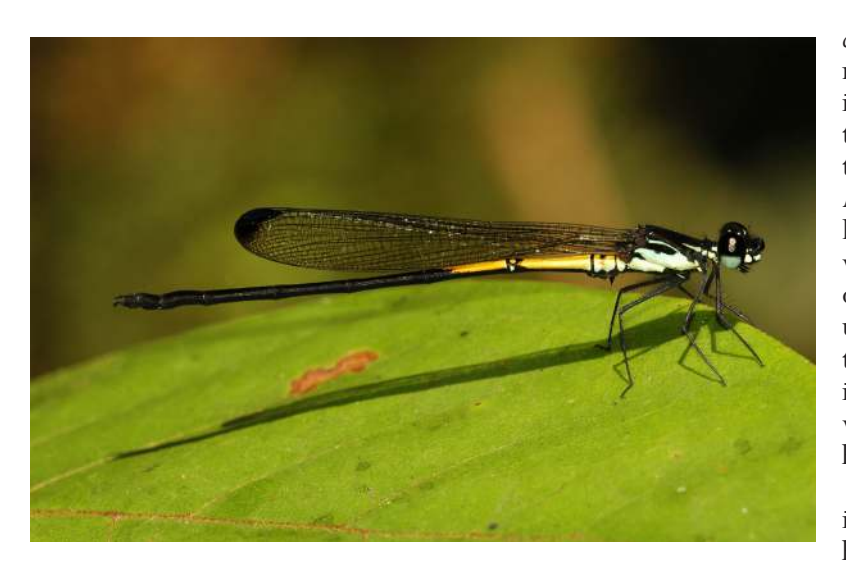
Figure 1. Rhinoneura villosipes male, Mt Kinabalu, Sabah.

The chlorocyphid genus Rhinoneura has two species: R. villopsipes Laidlaw, 1915 (Fig. 1), known only from montane forest streams on Mount Kinabalu in Sabah, but regularly encountered near the headquarters of the National Park, and R. caerulea Kimmins, 1936 (Fig. 2), until now only known from the type series of two males and one female, collected in montane forest above 1,000m on Mount Dulit in north-east Sarawak in 1932.