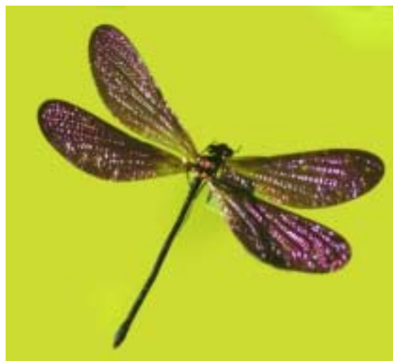
Female: photo by Matti Hämäläinen