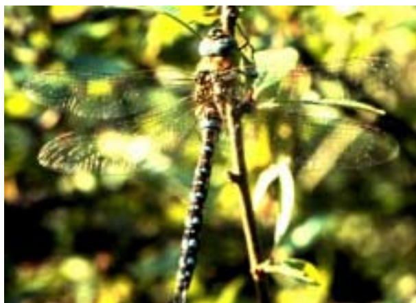
Aeshna mixta

Then, to shorten my list of contenders, I pick on Aeshnidae. Generally, I like their appearance (especially shape of the head and bright green or blue eyes) and their behaviour. In Japan most of them are active only before sunrise and after sunset. It means that it is not so easy to see them in daytime. Whenever I see Anaciaeschna martini or Polycanthagyna melanicter , I remember childhood days when I was so often scolded by my mother because of being late coming home. I am now living in Hokkaido (northern island of Japan) having recently moved here from Tokyo, and a new aeshnid has just been added to my collection. It is Aeshna mixta which is very beautiful to me with blue and green markings on black (male). This is one of the few to be active in daytime. I am happy to see them fly over the ponds in Sapporo city, even though, at the same time, I feel a little sorry because it means the dragonflies' season is near to its final stage for this year.