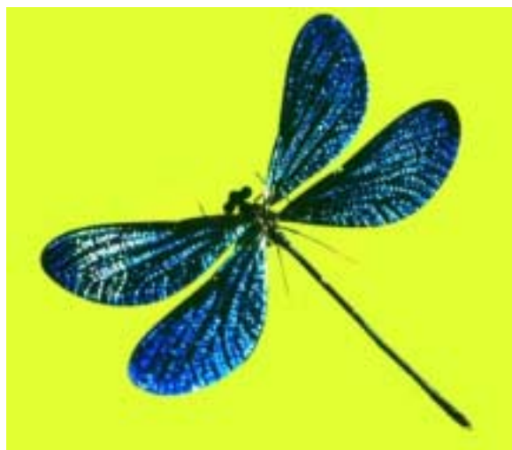
Male: photo by Matti Hämäläinen