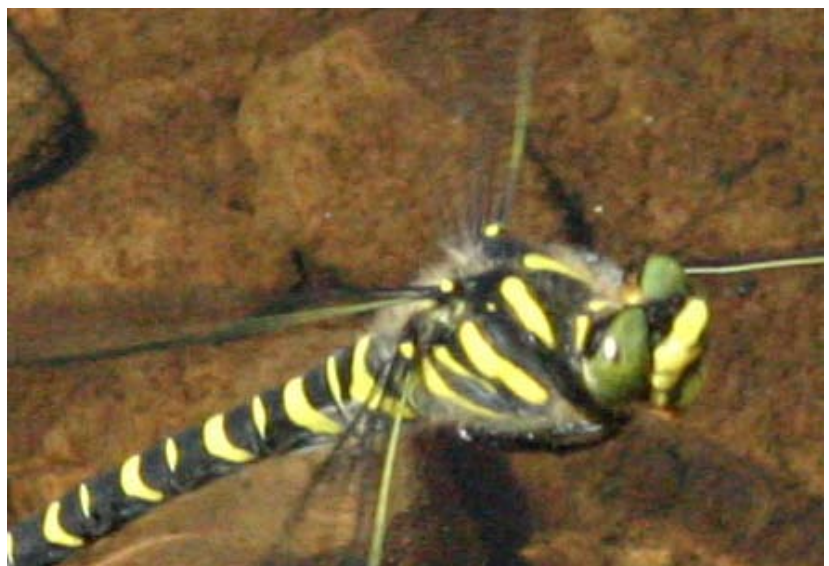
Photo 7: Cordulegaster boltonii laying eggs showing legs against thorax.