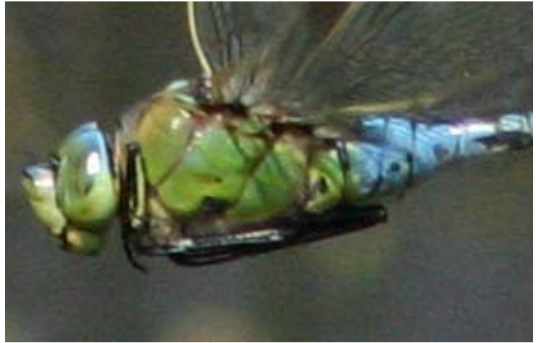
Photo 4: Anax imperator also with legs behind the eyes.

in flight, the head is rotated to keep it steady in relation to the background, as you can see from this image of a southern hawker ( Aeshna cyanea ) (see Photo 1). He finds the same applies to wasps and even blowflies when banking in flight.