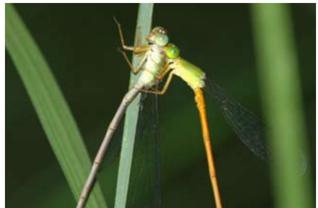
Figure 2. Male Ceriagrion auranticum attacks female.