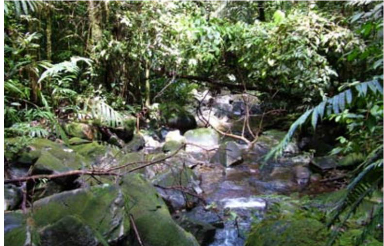
Figure 3. R. caerulea habitat, ca 1,350m, Hose Mountains.

Graham worked a smaller stream nearby and Luke and Manau looked for more streams. Soon after the party split Rory had one of those rare ecstatic field work moments, on sighting and then catching a single male caerulea just before the sun decided to disappear. This caused him to perform a small dance at the spot of capture; a performance that was repeated with a can of beer in hand (carried just in case something really special was found) once the rest of the party rejoined him. Graham, who had spent a frustrating day battling through thorny plants and impenetrable tree falls on his poxy shaded little trickle, congratulated Rory through clenched teeth.