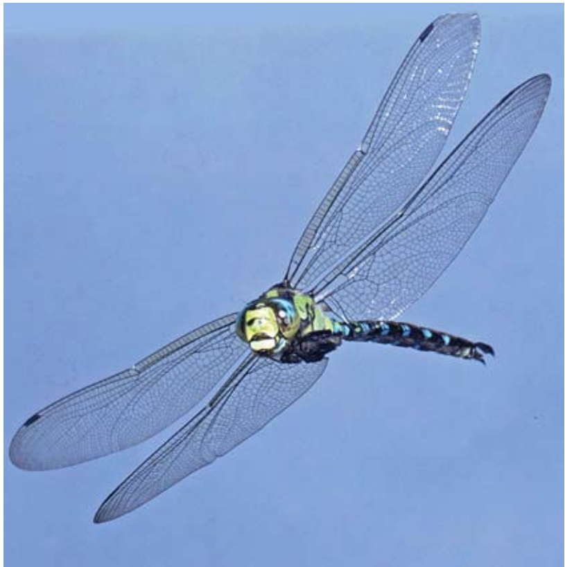
Photo 1: Aeshna cyanea showing head rotating as the animal banks in flight.