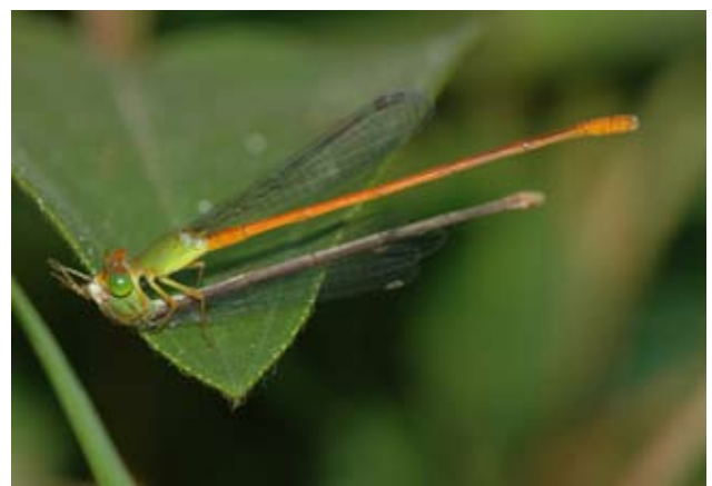
Figure 3. Male Ceriagrion auranticum consuming female.