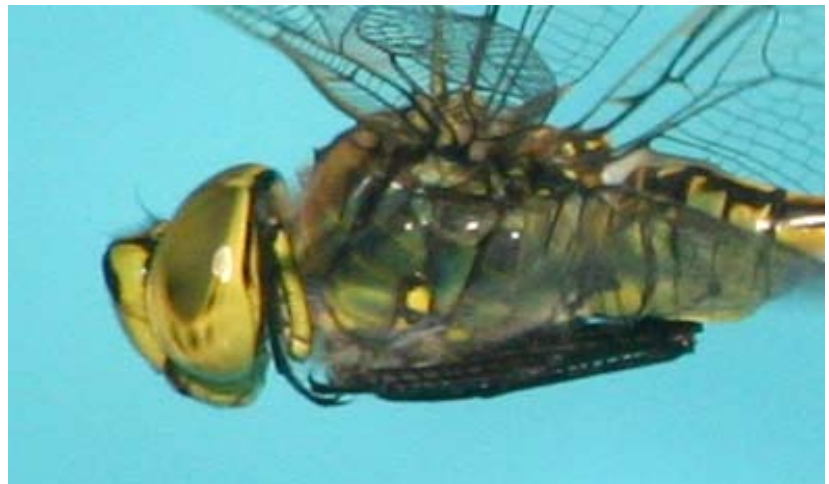
Photo 6: Hemianax papuensis with front legs firmly behind the eyes.

I still wonder about the emperors: with the legs apparently so firmly behind the eyes, they could be used for some other purpose – having so many tactile setae, they may aid in assessing body orientation, for instance.