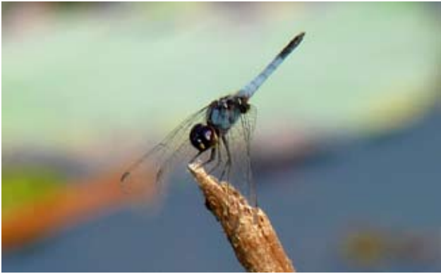
Photo 8: Aethriamanta aethra .