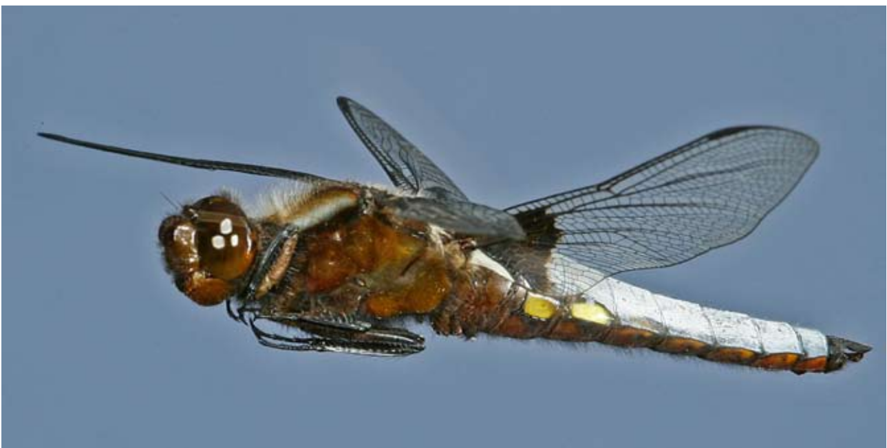
Photo 2: Libellula depressa showing how the legs are placed in flight.