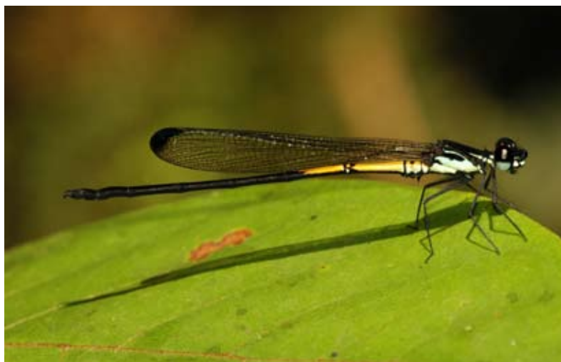
Figure 1. Rhinoneura villosipes male, Mt Kinabalu, Sabah.

The chlorocyphid genus Rhinoneura has two species: R. villosipes Laidlaw, 1915 (Fig. 1), known only from montane forest streams on Mount Kinabalu in Sabah, but regularly encountered near the headquarters of the National Park, and R. caerulea Kimmins, 1936 (Fig. 2), until now only known from the type series of two males and one female, collected in montane forest above 1,000m on Mount Dulit in north-east Sarawak in 1932.