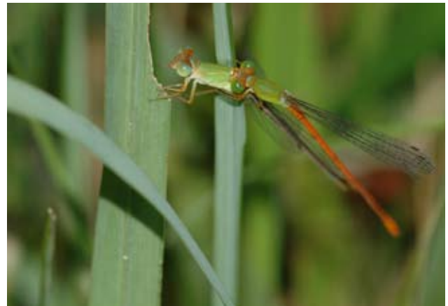
Figure 1. Male Ceriagrion auranticum seizes female.

Corbet, P.S. 1999. Dragonflies – Behaviour and Ecology of Odonata . Cornell University Press, Ithaca, New York.