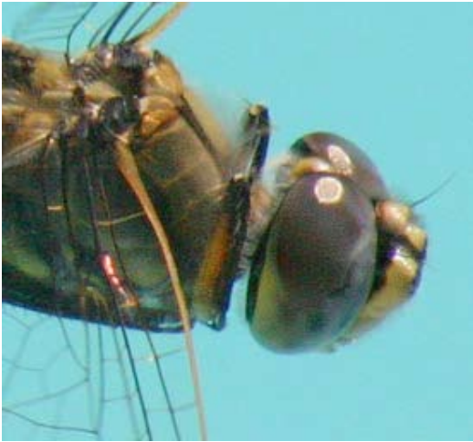
Photo 3: Hemicordulia tau with front legs clearly not touching the head.