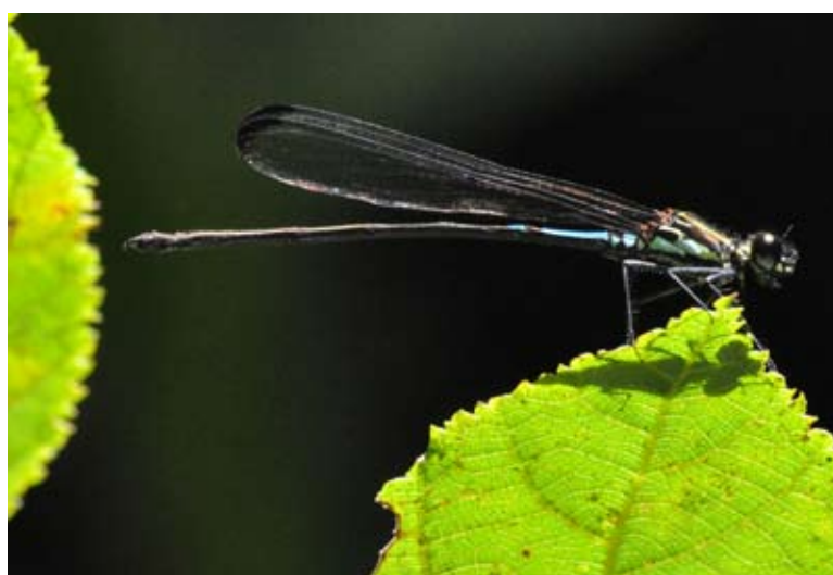
Figure 2. R. caerulea male, Hose Mts, Sarawak (Photo: G.T. Reels).

we would not get into any good habitat. The first problem was encountered the day after we arrived at the foot of the mountains. There is a logging road (no longer in use) at the northern end of the mountains, which was supposed to cross the range, reaching at least 1,300m in the process. To reach this road took about one and a half hours along an awful dirt track, but almost immediately after we got onto the logging road we were stopped in our tracks by a broken bridge. After much debate, arrangements were made to find someone from Kampung Tunoh, the